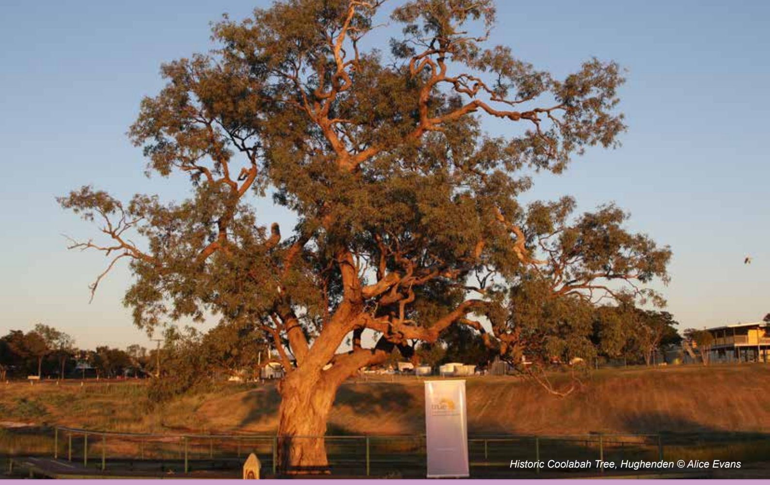
Reaching rural and remote locations across Queensland, including Augathella, Bowen, Clermont, Collinsville, Dysart, Hughenden, Julia Creek, Mitchell, Quilpie, Richmond, Texas and Thargomindah.